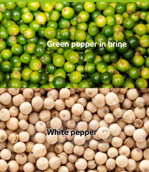
Green pepper in brine