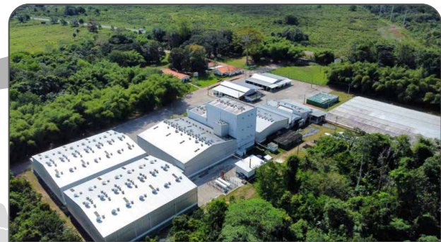
Tropoc, Castanhal, Brazil